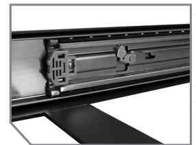
STAINLESS STEEL SLIDE RAILS