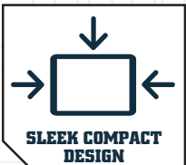
SLEEK COMPACT DESIGN