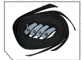
4 HEAVY-DUTY STRAPS INCLUDED

The Heavy Duty Fridge Slide from Overland Vehicle Systems is a reliable companion for off-road enthusiasts, boasting a robust construction designed to withstand the toughest conditions. Its 2 stage black powder coating not only enhances its longevity but also provides a sleek appearance. Constructed from heavy-duty steel and featuring stainless steel sliders and hardware, this fridge slide ensures a lightweight yet sturdy solution for securely transporting your essentials. The heavy-duty handle, easy-to-use locking mechanism, and multiple anchor points make it a user-friendly and versatile option, while the extra space for storing items adds practicality to this indispensable overlanding accessory.