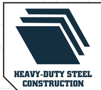
HEAVY-DUTY STEEL CONSTRUCTION