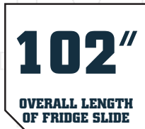
102" OVERALL LENGTH OF FRIDGE SLIDE