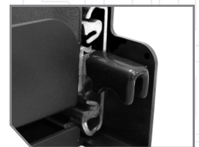
EASY TO USE LOCKING MECHANISM